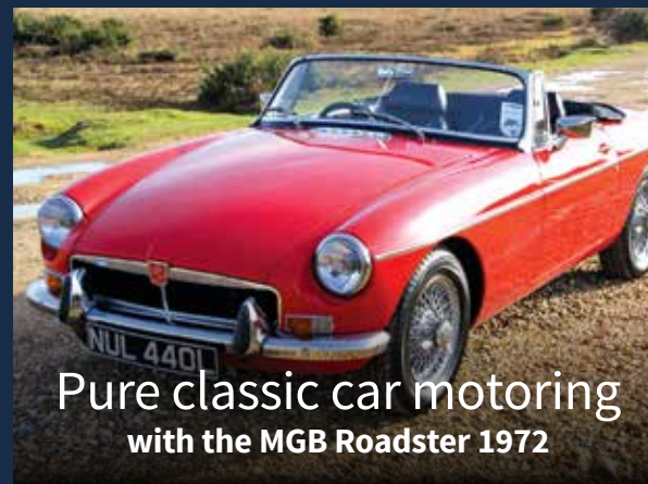
Pure classic car motoring with the MGB Roadster 1972

Read more Frequently Asked Questions (FAQS) on our website.