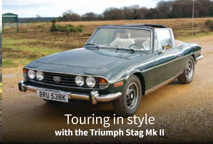
Touring in style with the Triumph Stag Mk II