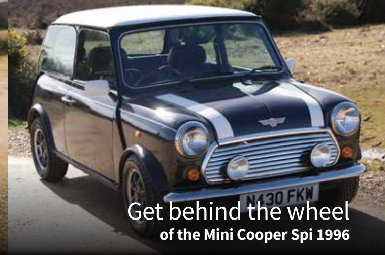
Get behind the wheel of the Mini Cooper Spi 1996