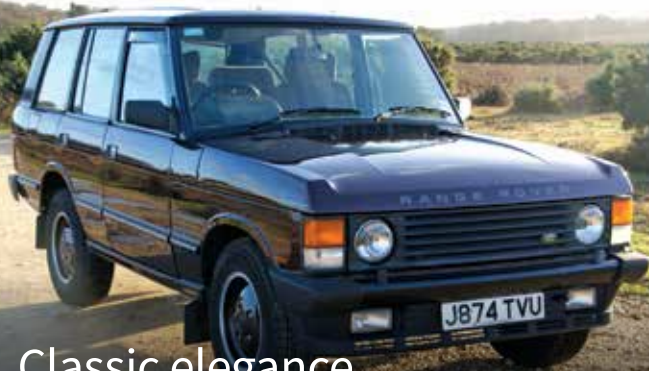
Classic elegance from the Range Rover Vogue 1992