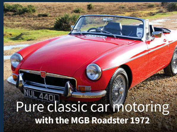
Pure classic car motoring with the MGB Roadster 1972

Read more Frequently Asked Questions (FAQS) on our website.