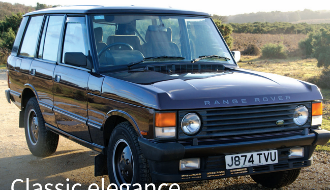
Classic elegance from the Range Rover Vogue 1992