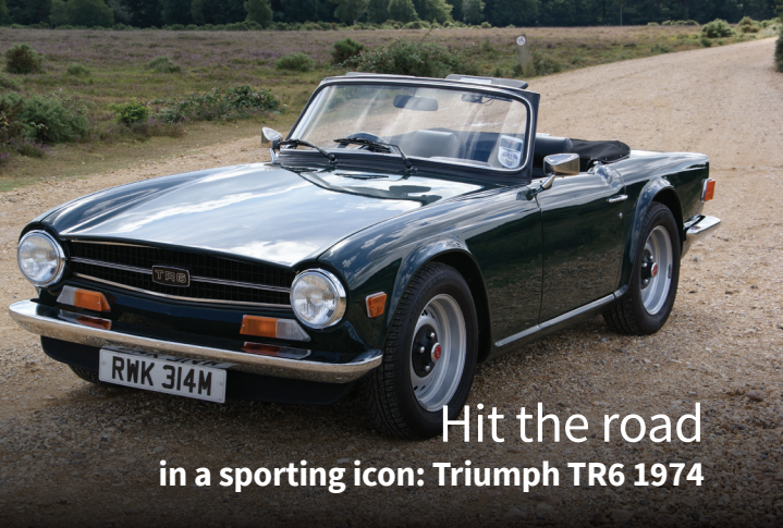
Hit the road in a sporting icon: Triumph TR6 1974

Hire an iconic British classic car and hit the road!