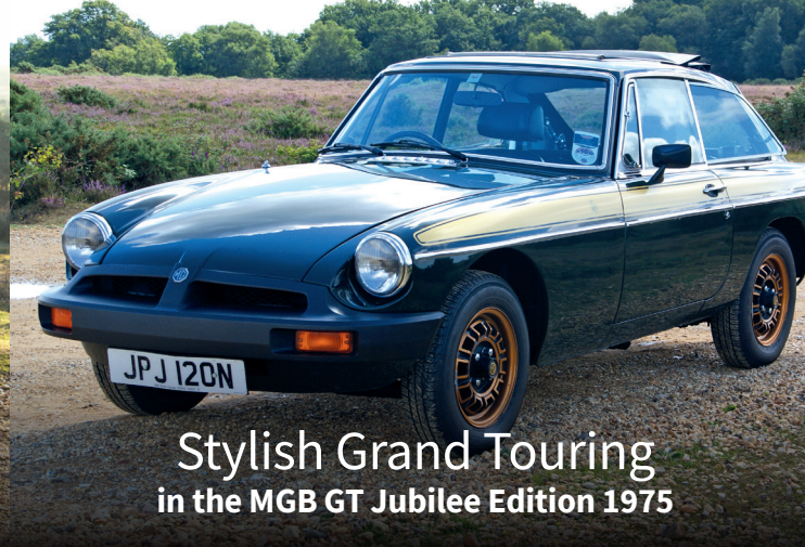
Stylish Grand Touring in the MGB GT Jubilee Edition 1975