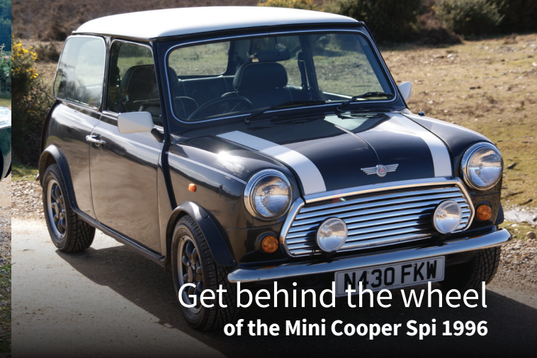
Get behind the wheel of the Mini Cooper S 1996